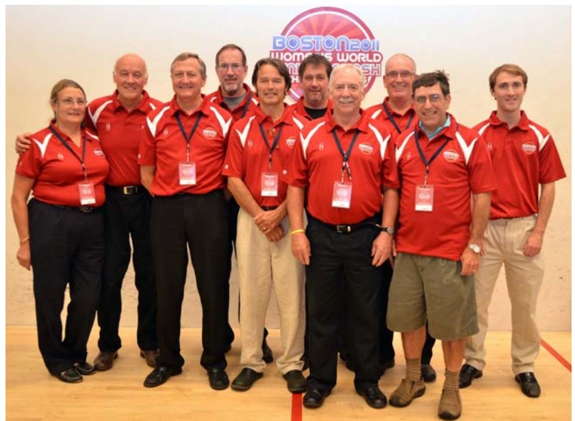
Boston Referees on Parade

David Palmer lost to Gregory Gaultier 9-11, 4-11, 0-11 (47m)